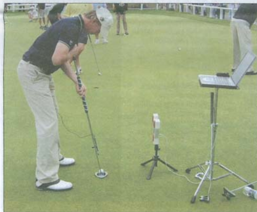
The SAM PuttLab is being used in more than 20 countries.